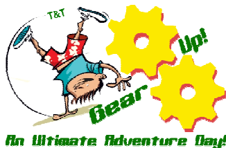
An Ultimate Adventure Day!

To register and see the Gear Up events schedule, as well as coaching instructions and rules, visit our North Carolina Awana website at www.awananc.com .